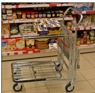
Small Store Trolley