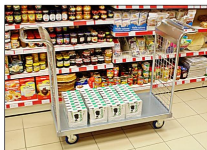
Bulk Stock Trolley