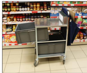
Mobile Loose Stock Table