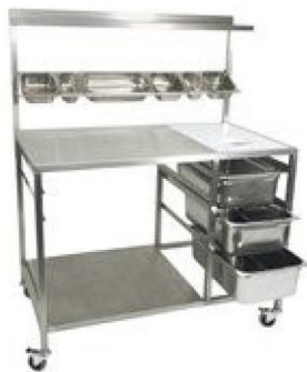
FAST FOOD TAKEAWAY / COFFEE SHOP