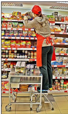
2 Step Mobile Merchandising Table