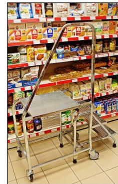
3 Step Mobile Merchandising Table