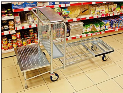
Large Store Stock Trolley

Help your staff to act safely, productively and professionally when replenishing stock.