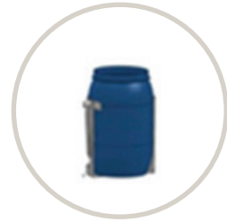
Stratasys H350 powder container Add what you need