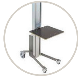
Trolley Easy build box transport