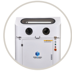
Powder retrieval station Solution for Stratasys H350 printer or your choice