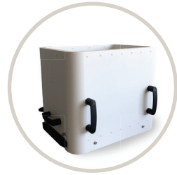
Stratasys H350 build removal box Simple, transportable add what you need