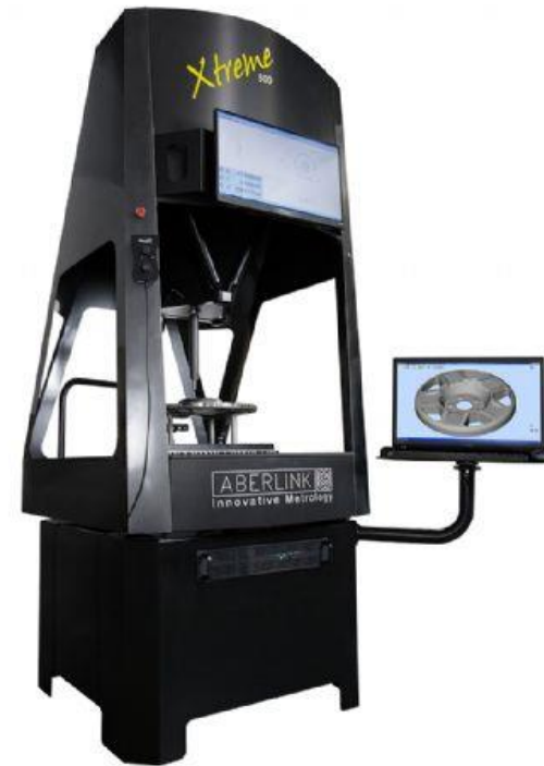
Latest Aberlink Measuring Machine

Rowan Precision are a well-established UK manufacturing company, based in the Midlands, with a proven quality system, maintaining a rigorous inspection regime to ensure all components reach our customers to their specifications.