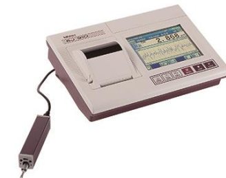
Keyence Optical Comparator