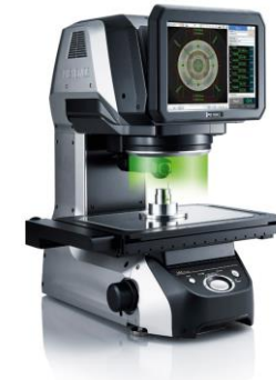
Keyence Laser Measuring System