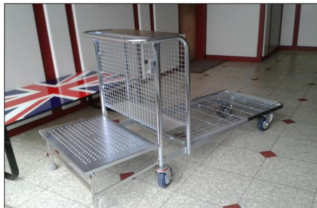
Folding step shown down when stocking the shelves