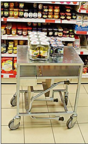
The integral steps rotate out from under the table...

Help your staff to act safely, productively and proactively when replenishing stock