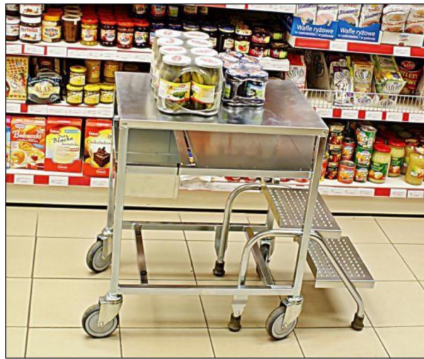
And act as a brake when being used