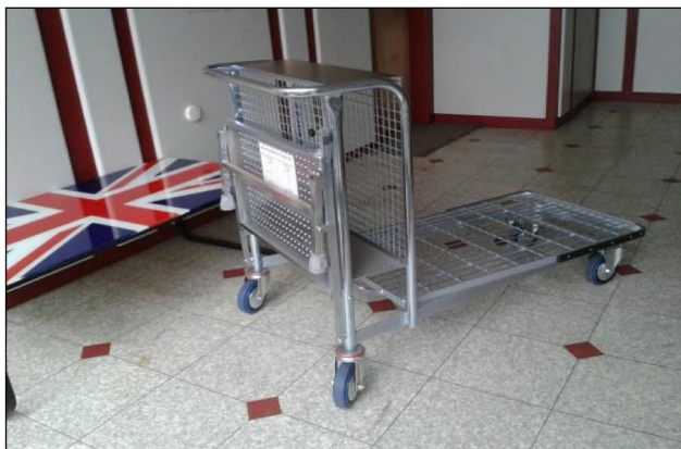
The folding step is up when moving around the store

Help your staff to act safely, productively and proactively when replenishing stock